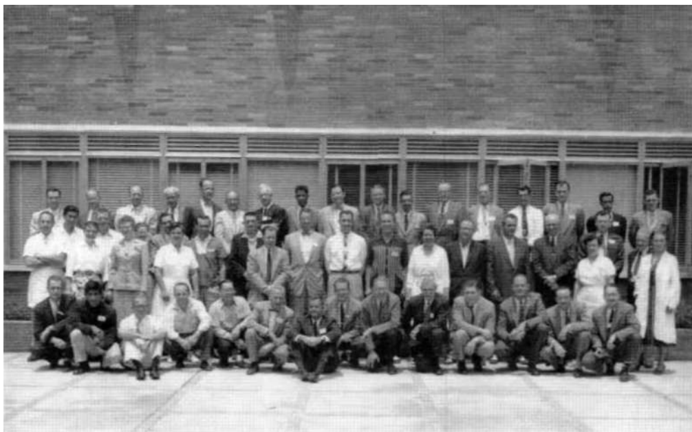
PROSTHETICS EDUCATION AT UCLA—First of a new series. Pictured are the students and instructors in the first West Coast school in Clinical Prosthetics: Above-Knee Amputations held May 28 through June 8 in the new facilities of the Prosthetics Education Project at the University of California Medical Center, Los Angeles.