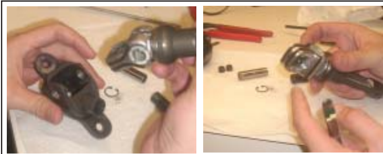
Disassembling the Mauch Hydraulic Ankle: The left photo shows the Housing (left) with the Piston Rod within the Shank Tube (right) removed. Visible in the base of the concave-shaped Housing is the gravity-activated Ball that closes the Control Port and prevents the flow of hydraulic fluid when the Shank is at vertical during mid-stance. The right photo shows the layered Chamber Sealings at the base of the Piston Rod. Fluid from the Back Chamber opens the Flap Valve at the site of the bore in the center.