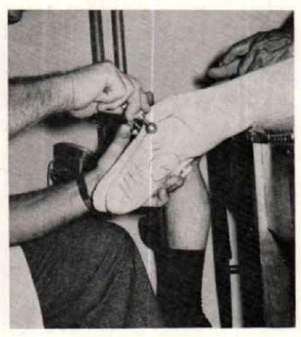
No. 3, 4 & 5