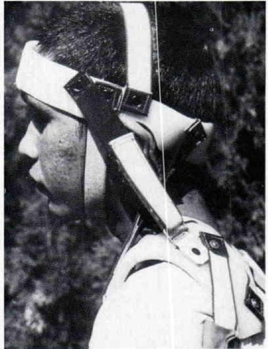
Figure 1. Lateral view of the orthosis.

In order to prevent the displacement of cephalic and shoulder polyethylene bands from their original position when the corrective forces are in operation, a harness system is essential. The shoulder band is retained in its place by a figure eight harness mechanism, whereas the cephalic