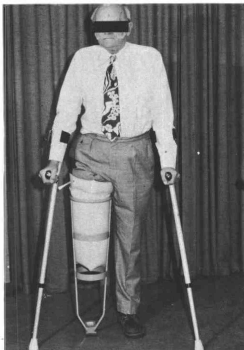
Fig. 2. Pneumatic walking aid applied to patient.

Five patients had to be withdrawn from the trial for various reasons not connected with the