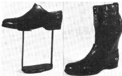
Fig. 1. Left, patten ended orthosis. Right, internal shoe extension.

Access is achieved through a laced front section which, when secure, will maintain the foot in position supporting the proximal joints.