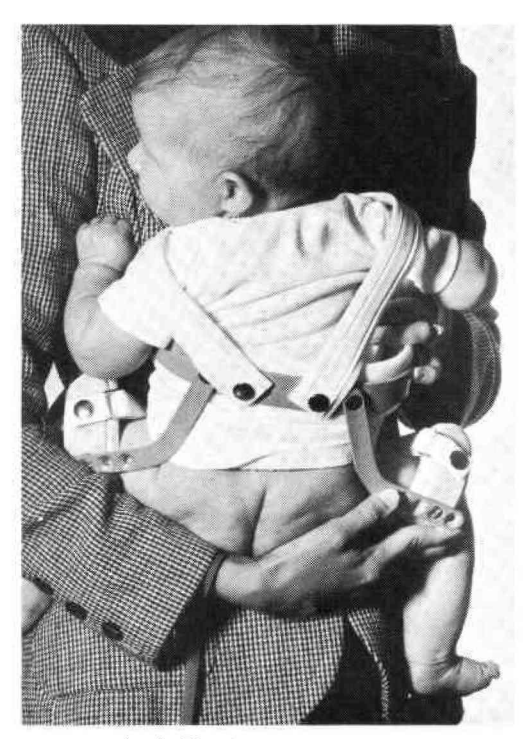
Fig. 2. The "occasional cuddle".

The device has now been used for a year with 20 patients completing treatment. All hips remain reduced and no instances of avascular necrosis have been recorded. However, this experience is currently uncontrolled and a longer-term controlled study is underway. At present however, the mothers involved are